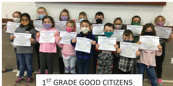
1 ST GRADE GOOD CITIZENS