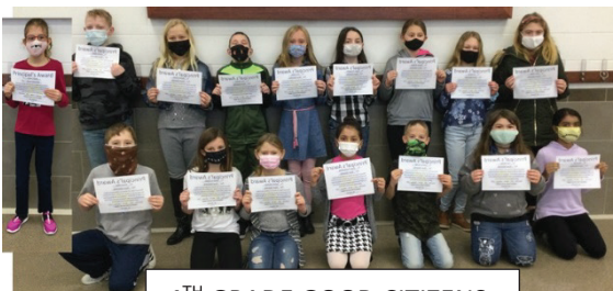
4 TH GRADE GOOD CITIZENS