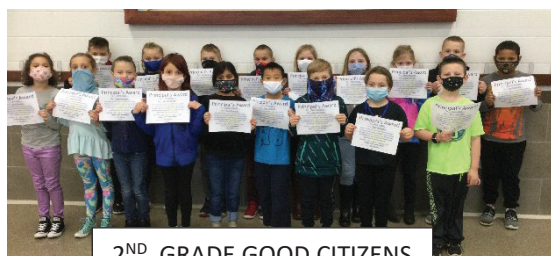
2 ND GRADE GOOD CITIZENS