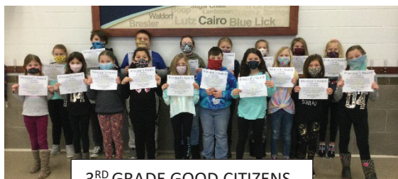
3 RD GRADE GOOD CITIZENS