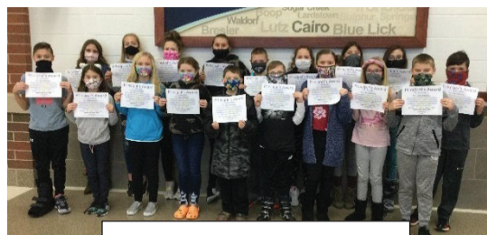
5 TH GRADE GOOD CITIZENS