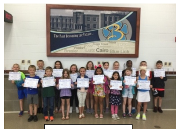
2 nd Grade