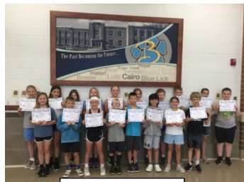
4 th Grade