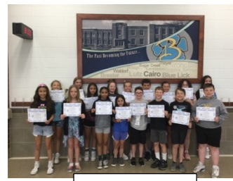
5 th Grade