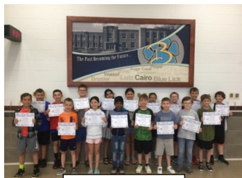
3 rd Grade