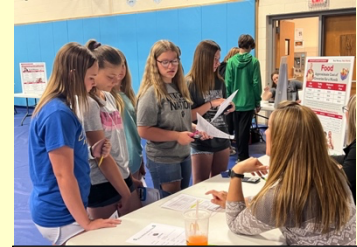
Real Money, Real World