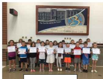
1 st Grade

In first and second semester of each year, three students from each of the first through fifth grade classrooms are recognized for being Good Citizens in our school. Congratulations to all our Good Citizens!