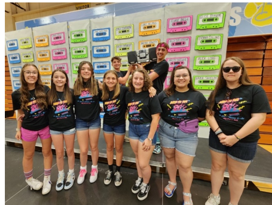
Wildcats took it back to the 80s for dinner theatre.