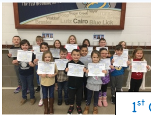
1 st Grade

In the first and second semester of each year, three students from each of the first through fifth grade classrooms are recognized for being Good Citizens in our school. Congratulations to all our Good Citizens!