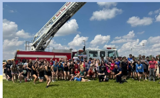
Bath Fire and EMS made a special appearance at middle school field day

Full school calendar on our website: https://www.bathwildcats.org/SchoolCalendars.aspx