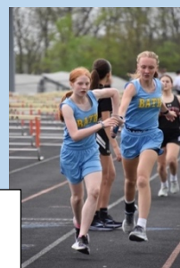
School record girls 4x800 meter relay team makes an exchange