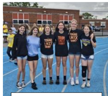
Relay for Life