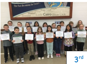
3 rd Grade