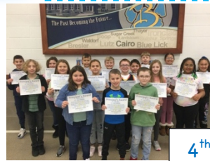
4 th Grade