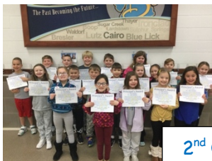
2 nd Grade