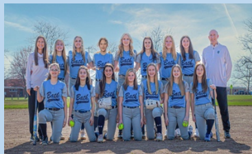
Undefeated middle school softball team!