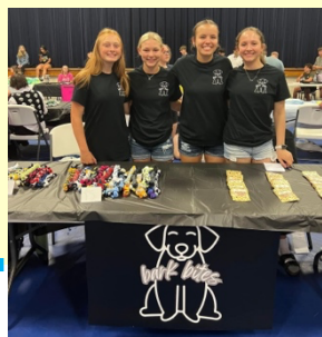
Students showing off their products at the business fair