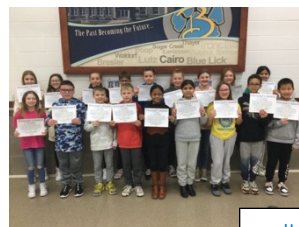
5 th Grade