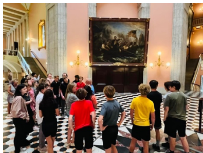
7th grade students tour the Ohio Statehouse in Columbus